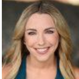
By REBECCA STRONG JULY 27, 2023

BE MINDFUL OF THESE ELEMENTS, WHICH CAN EITHER MAKE OR BREAK YOUR OUTDOOR SPACE.