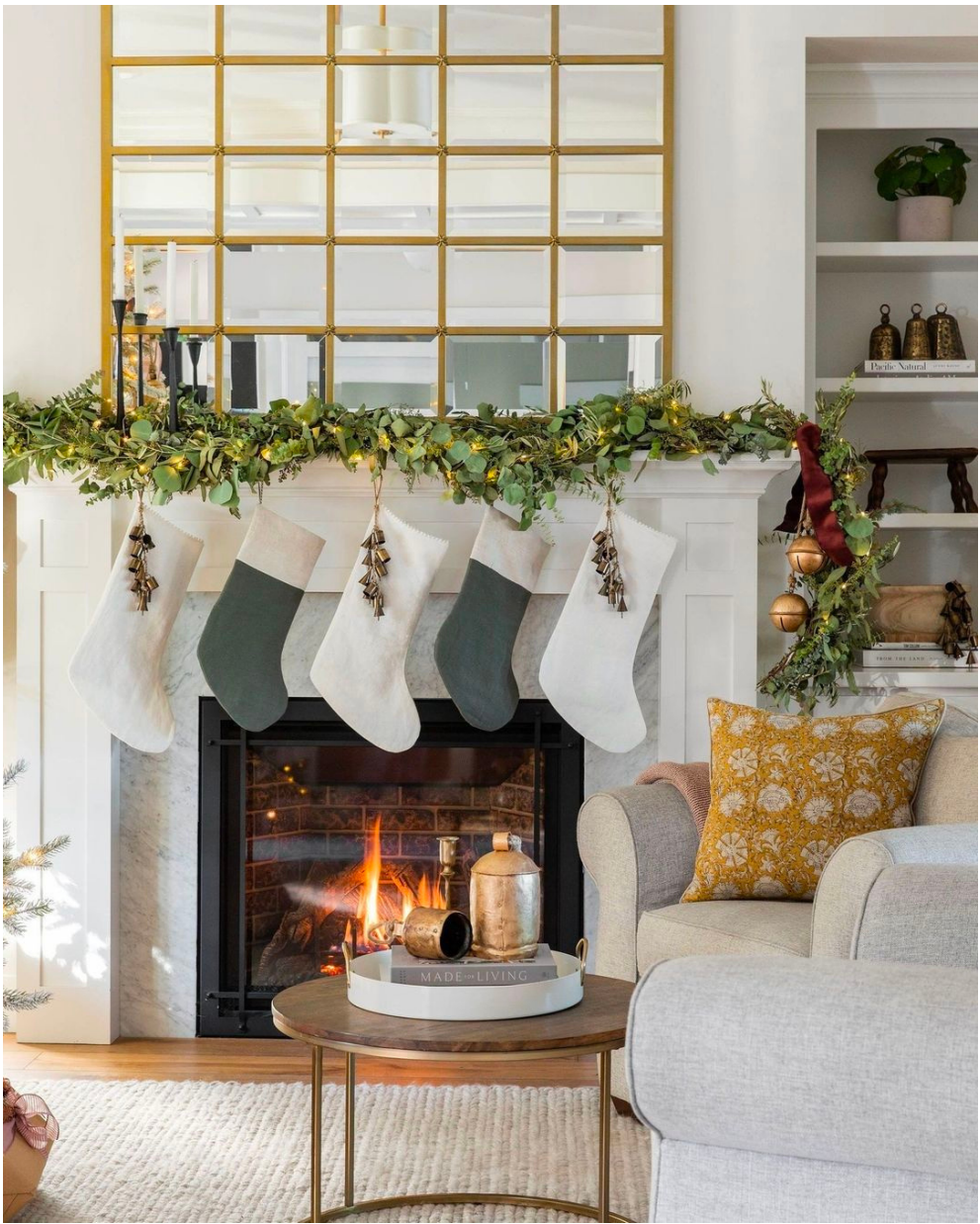
Interior Design: @marindesignco | Photography: @nicolediannephoto