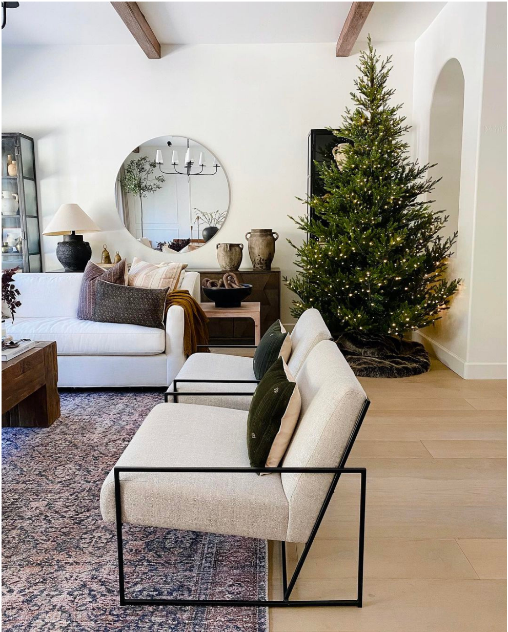
Interior Design: @jaci.daily

When you combine fresh greens, bundled firewood, and chunky woven blankets, you get holiday inspiration like no other. And the miniature trees on the mantle are a *chef's kiss* to seasonal cheer.