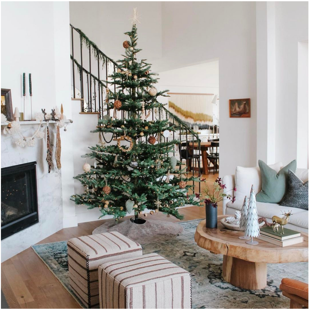
Interior Design: @audreyscheckdesign