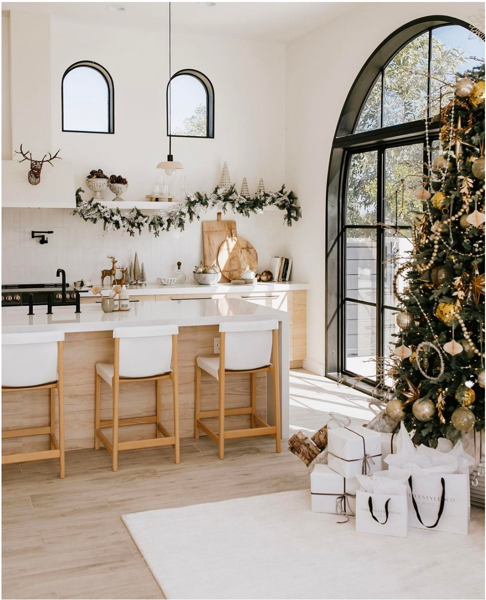
Interior Design: @thelifestyledco | Photography: @madi.robison

We like to think of the mantle as the centerpiece of holiday design. It's an exercise in creativity with plenty of opportunities to layer texture, color, and natural greens. Marin Design Co. did all of the above and created the ultimate living room focal point.