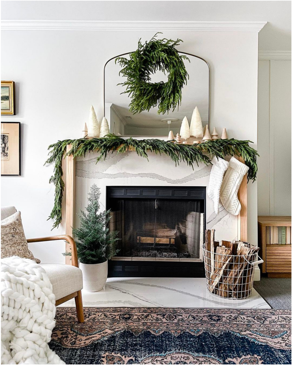
Interior Design: @kcdesignco